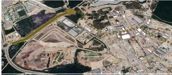
AIRPORT CONNECTOR – SECTION 1

Section 1 of the ACR which extends from the Esterley Tibbetts Highway to Alie B Drive is complete. Section 1 costs approximately $10.2M.