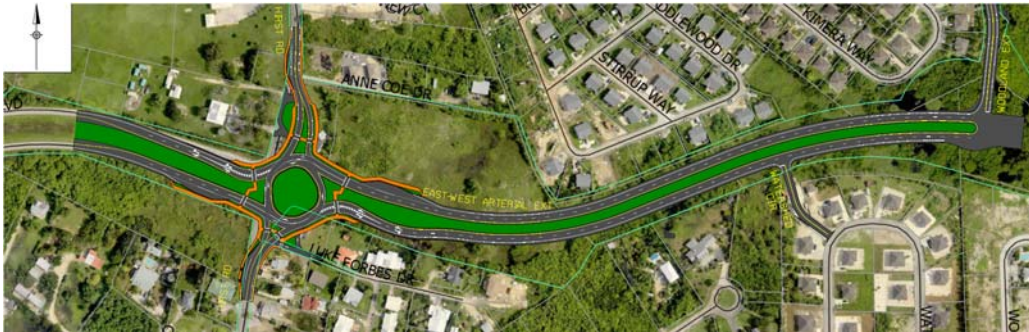
E-W Arterial Segment 1 (Hirst to Woodland Dr area)