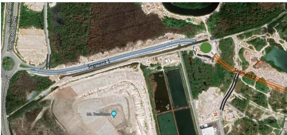
Airport Connector – aerial photo Feb 2022 w/ graphical overlay