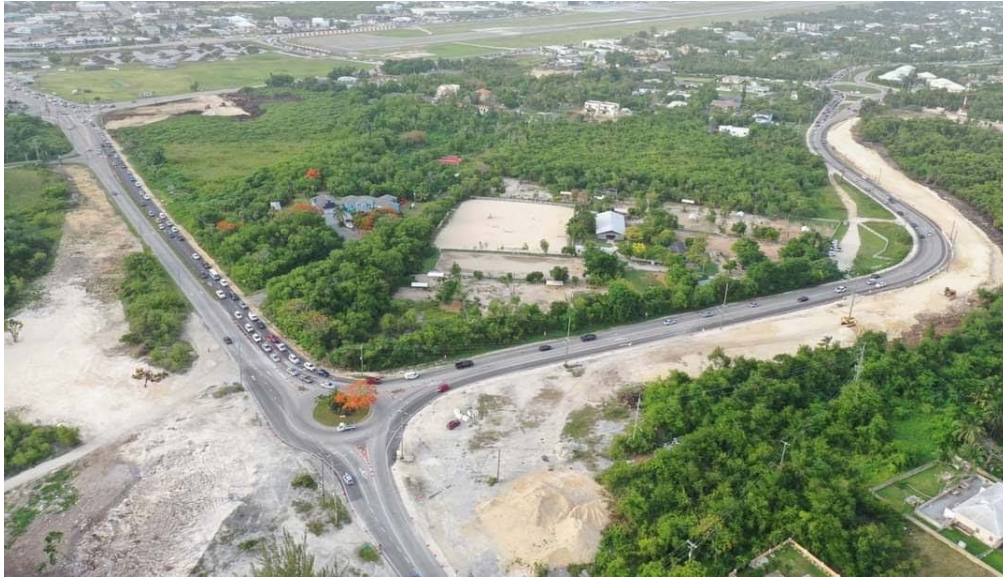
Aerial view of the progress on LPH works – July 2022